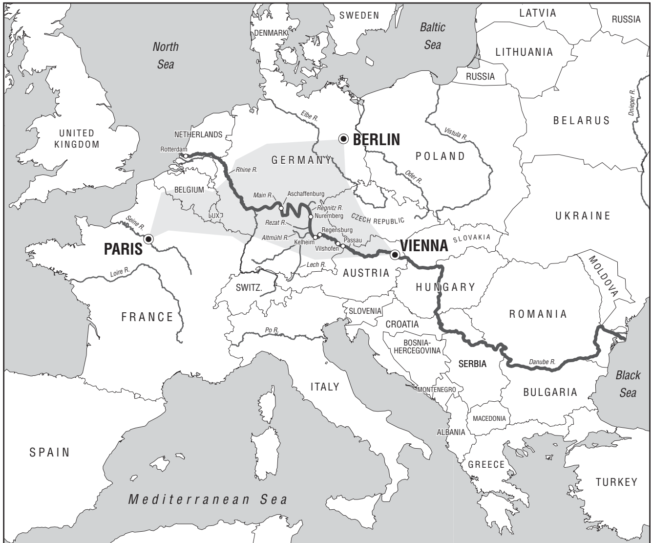
FIGURE 1 The Rhine-Main-Danube Canal: Crucial Transport Axis for Europe

European infrastructure, in stark contrast with that of Africa, is so highly developed that you can travel from the Black Sea, through the Danube-Main river/canal system, to the Rhine, then north to the port of Rotterdam. The map shows this route; the shaded area is what the Schiller Institute in 1989 dubbed the “European Productive Triangle”—the core high-technology area that could become the center of a vast program for Eurasian and African development. (The Rhine-Main-Danube canal system was completed in 1992.)