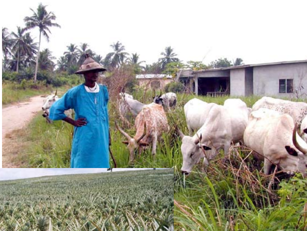
World Agricultural Forum